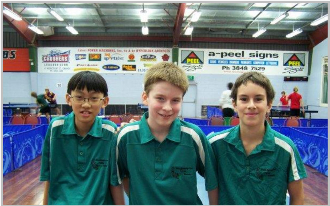
Queensland Junior Championships Brisbane in 2009