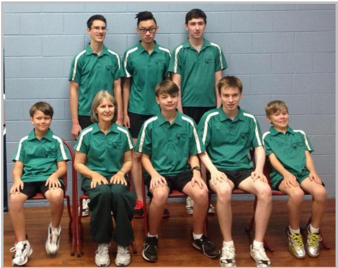
My Last Queensland Junior Championships in 2014