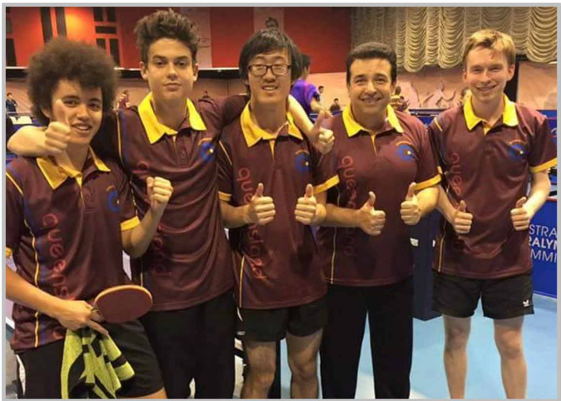
Under 21 Men's Gold Medal Australian National Championships in 2016