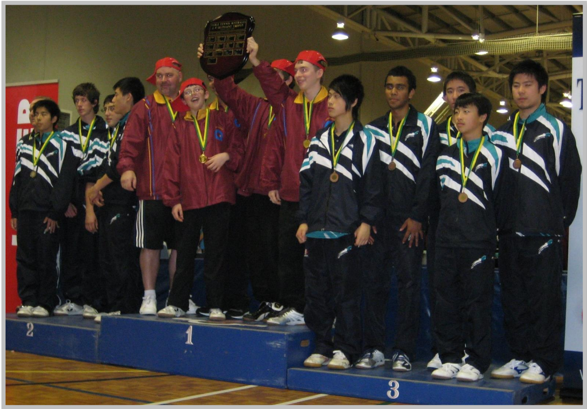
Under 15 Boy's Teams Gold Medal at the Australian National Championships Sydney in 2011