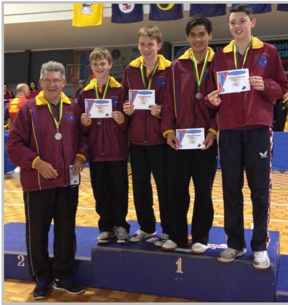
My Last Australian Junior Championships in 2014