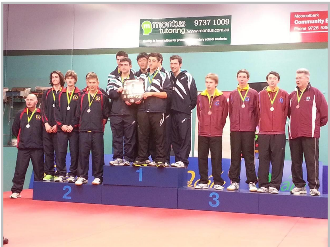
Under 18 Boy's Team Bronze Medal at the Australian Junior Championships Croymen in 2013