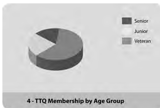
Figure 4 shows the membership of TTO split into age groups: juniors and youths, seniors and veterans. As can be seen a significant percentage of our membership is in the veteran's age group (60%). The second largest category of members is juniors and youths accounting for 24% of the membership.

The average age of a TTO member in 2008 was 43 years old.